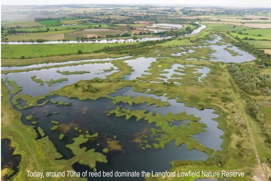
Today, around 70ha of reed bed dominate the Langford Lowfield Nature Reserve

Restoration blueprint for sustainable development that benefits both people and nature