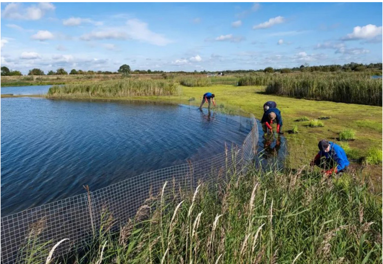
A team of 30 local volunteers support the reserve's management

From a working quarry to a thriving wetland, Langford Lowfields is testament to what can be achieved when industry, academia, and conservation organizations unite behind a shared vision. Its legacy is not just a restored landscape, but a blueprint for sustainable development that benefits both people and nature.